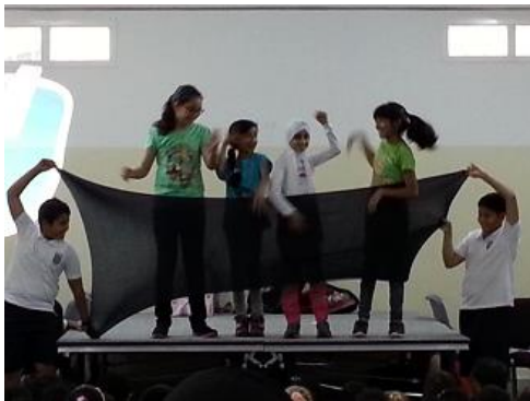
Grade 6 in action